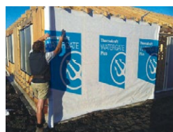
Fix securely to the frame with fasteners such as 6-8mm staples