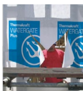
On arrival of doors and windows, cut Watergate at each opening on a 45° angle away from each corner. Pull the Watergate flaps inside and fasten to the inside of frame.