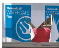
On arrival of doors and windows, cut Watergate at each opening on a 45° angle away from each corner. Pull the Watergate flaps inside and fasten to the inside of frame.