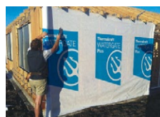
Fix securely to the frame with fasteners or tape.