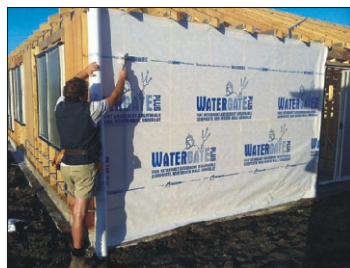
Fix securely to the frame with fasteners such as 6mm-8mm staples.

3. WATERGATE PLUS is wide enough to come from below the bottom plate to the top plate, covering all windows and door openings. Use extra fastenings around each window or door opening to be cut out.